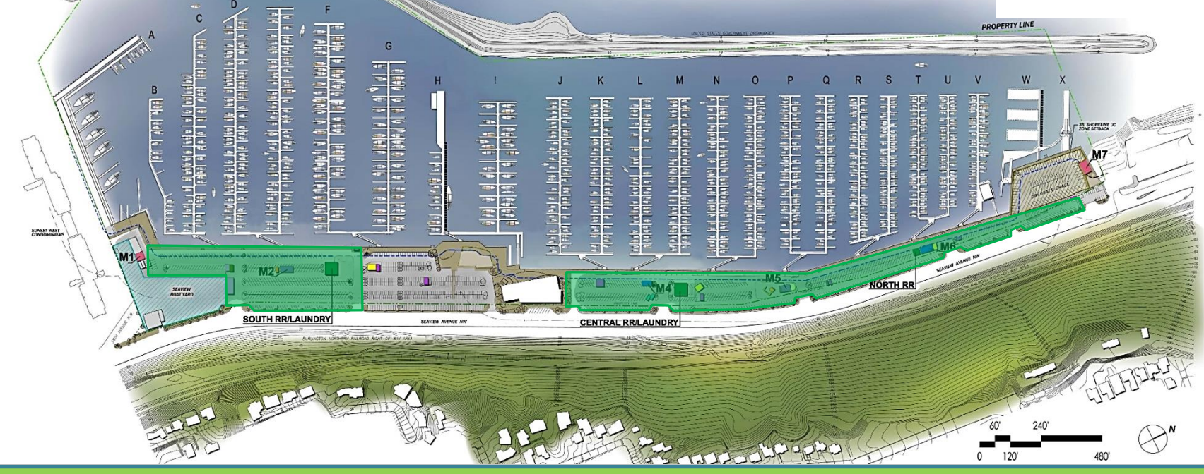
Paving Improved With Asphalt Overlay/Full Depth Reconstruction