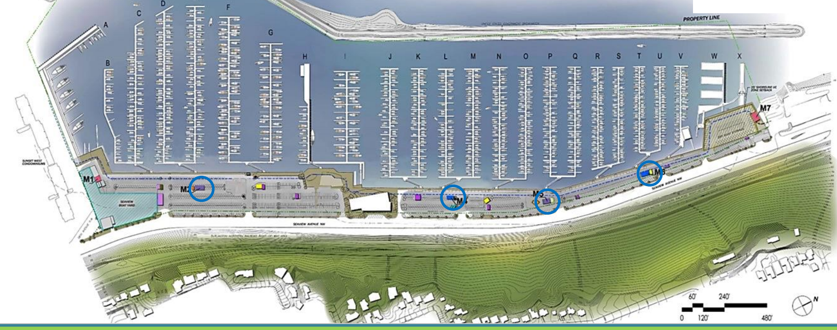
Current Locations Provide Easy Access