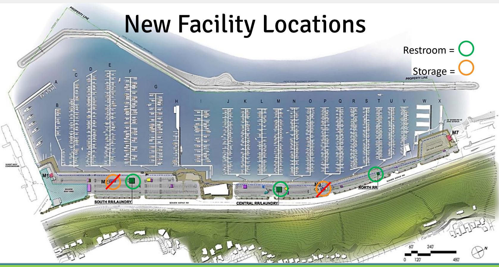
New Facilities Conveniently Located